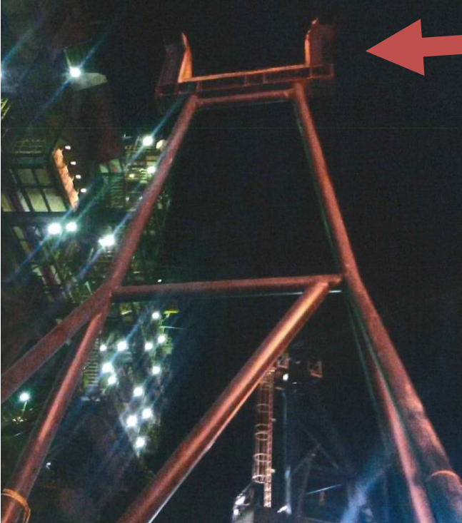
Original location of wooden support