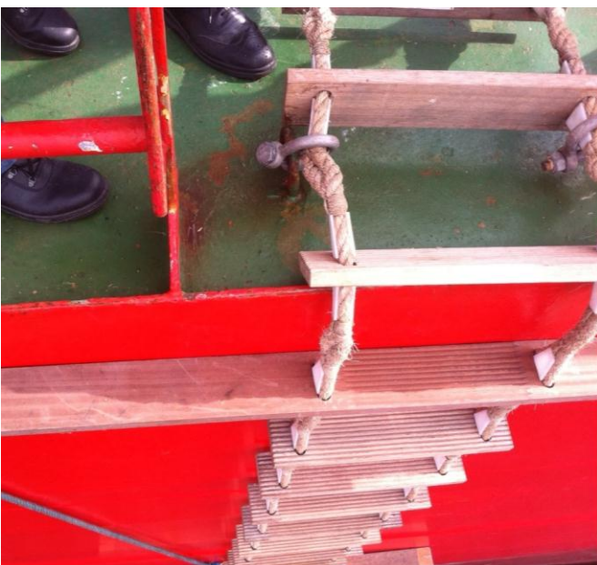
Pilot Ladder Deployed Over Sheerstrake