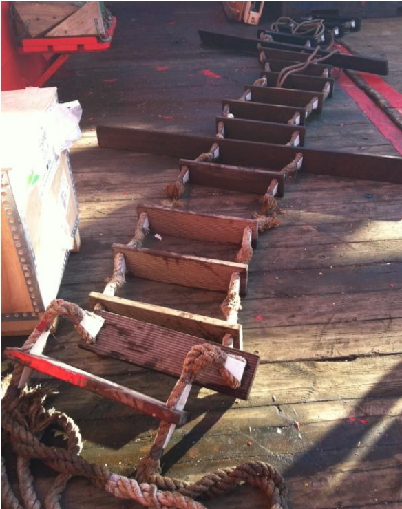
Damaged Pilot Ladder